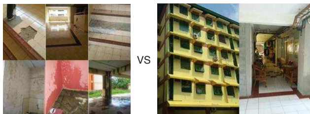
Plate 1. Public-rented residential building in slum conditions (left) compared to public-rented residential buildings in good condition (right)

The design stage of a building can be a positive or negative burden to the maintenance work (Chohan et al. , 2010). Several buildings are designed poorly affecting the maintenance